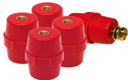
Insulator Terminal SM-35. SM-51. SM-76